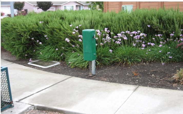
Dedicated Sample Station