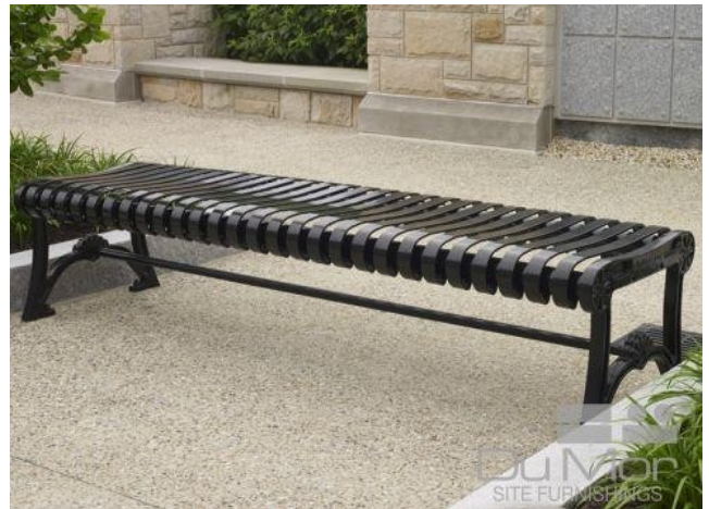
DT -Backless – Riverfront/promenade only Plaque on seat

Cast Iron and steel powder coated Finish