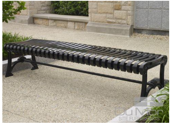
DT -Backless – Riverfront/promenade only Plaque on seat

Cast Iron and steel powder coated Finish