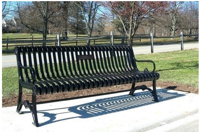
DT -with back -Parks, plazas Plaque on seat back