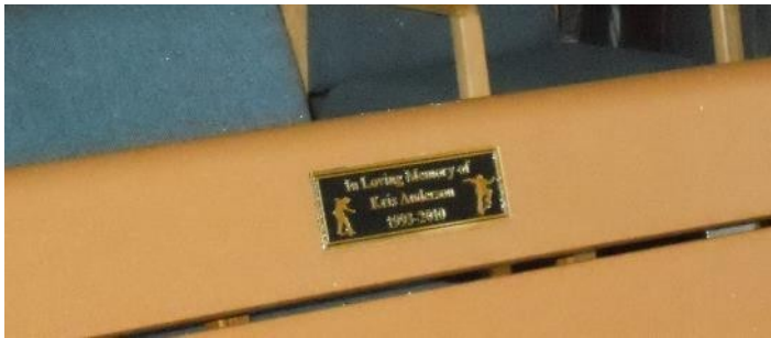
Plaque example – on seat back