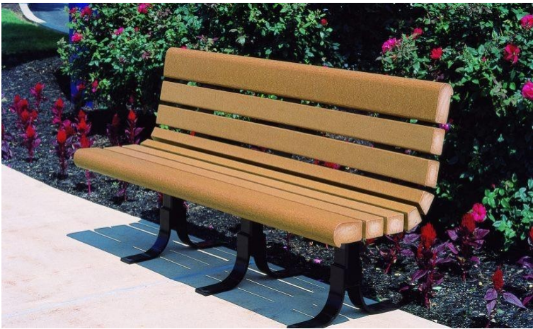
Parks Bench example