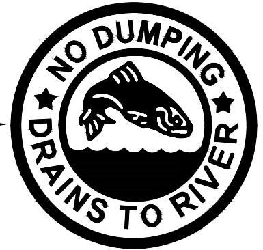
(B) 'NO DUMPING' MARKER

(A) MANHOLE COVERS WITH "NO DUMPING - DRAINS TO RIVER" SIGNAGE MAY SUBSTITUTE ADDITIONAL MARKINGS. STORMDRAIN COVERS SHALL BE FROM OLDCASTLE PRECAST MODEL: CIN-COVER.