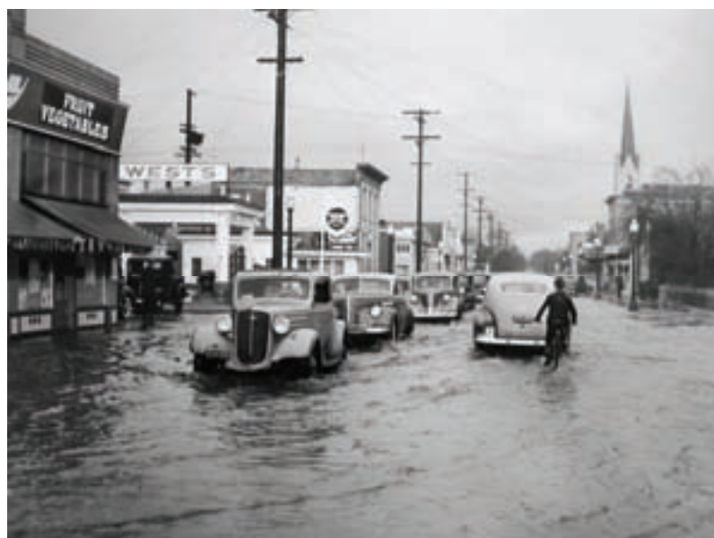
Main Street, Napa, February 1940