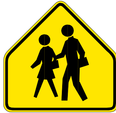
School Advance Sign

The school crossing sign, sometimes confused with the school advance sign, is intended for use at established crossings including signalized intersections used by pupils going to and from school. The sign should be omitted at crossings controlled by stop signs. Only crossings adjacent to schools and those on established school pedestrian routes shall be signed.