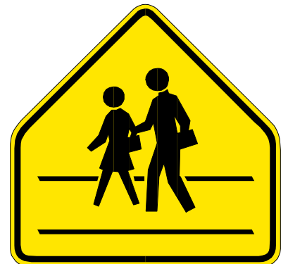
School Crossing Sign

In addition to the school speed limit sign, the School Advance Warning Sign may be used to in advance of established school crossings not adjacent to a school ground. Where used, the sign is generally erected 150 to 700 feet in advance of the crossing.