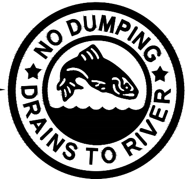
(B) 'NO DUMPING' MARKER

(A) MANHOLE COVERS WITH "NO DUMPING - DRAINS TO RIVER" SIGNAGE MAY SUBSTITUTE ADDITIONAL MARKINGS. STORMDRAIN COVERS SHALL BE FROM OLDCASTLE PRECAST MODEL: CIN-COVER.