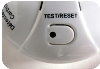
CHECK AND TEST ALL CARBON MONOXIDES DETECTORS