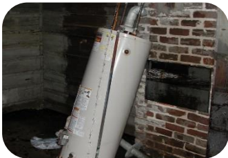
CHECK WATER HEATER STRAPS/ KEEP 3 FEET FROM ANY COMBUSTIBLE STORAGE