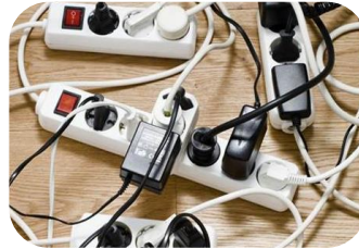
CHECK ALL ELECTRICAL CORDS