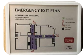
UPDATE EMERGENCY CONTACTS AND EVACUATION MAP