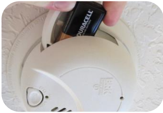
CHECK AND TEST ALL SMOKE DETECTORS