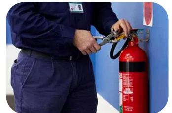
ANNUALLY SERVICE ALL FIRE EXTINGUISHERS