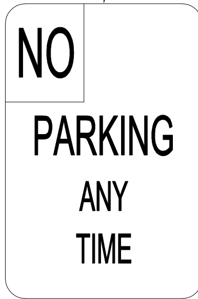
NO PARKING SIGN

CALIFORNIA SERIES R26 OR EQUIVALENT FOR TOW-AWAY TYPE SIGNAGE